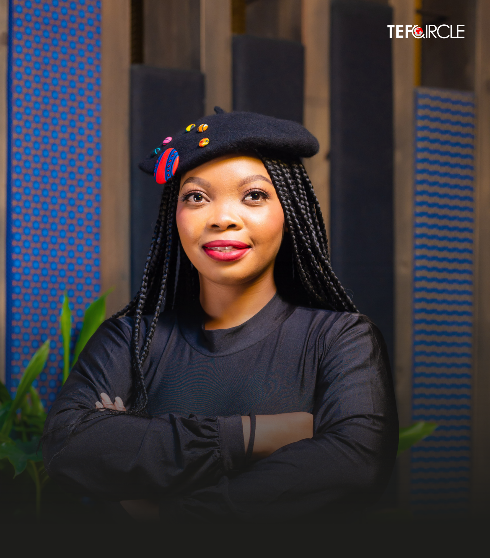
ARTS Creativity Meets Sustainability