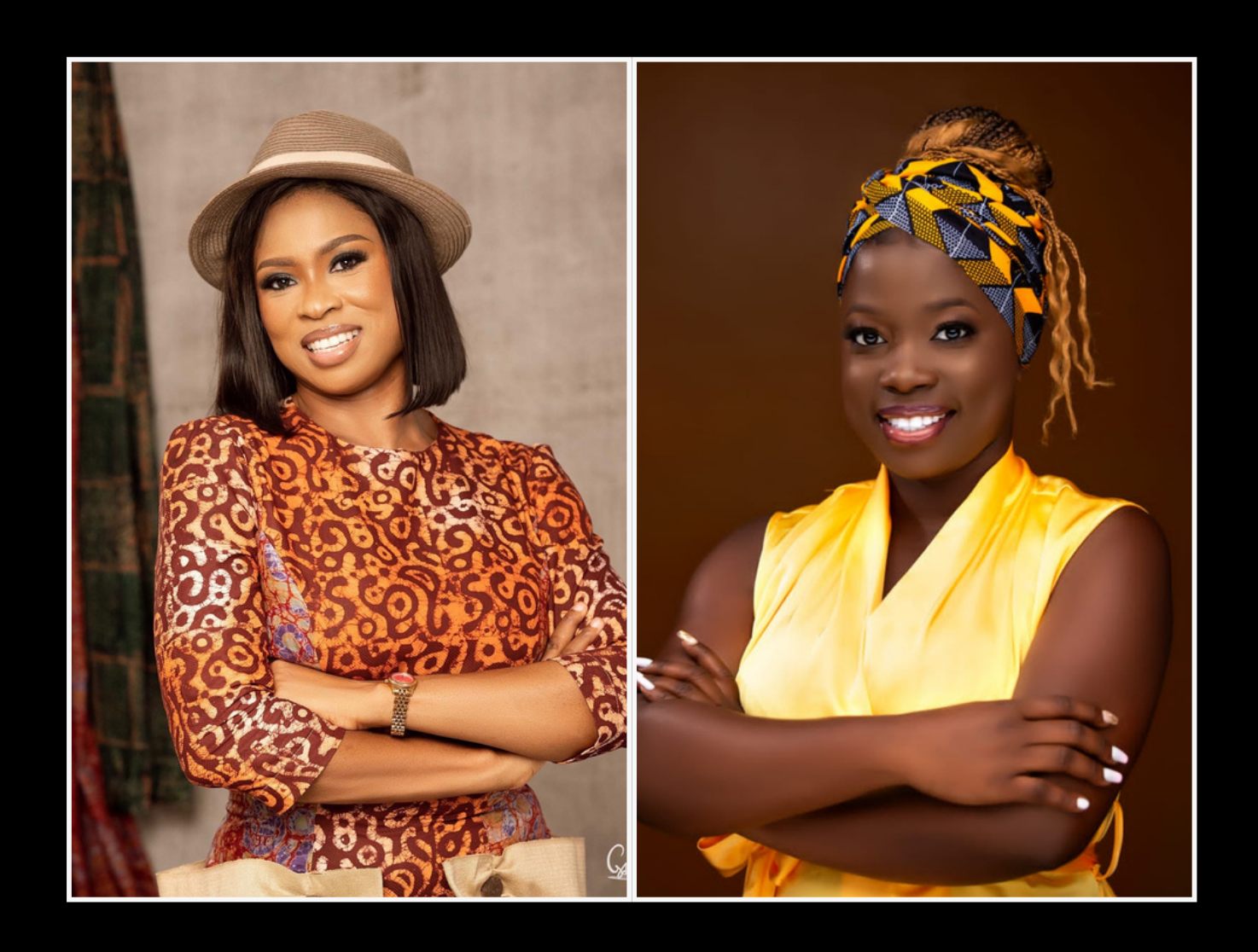
FASHION Creativity Meets Sustainability