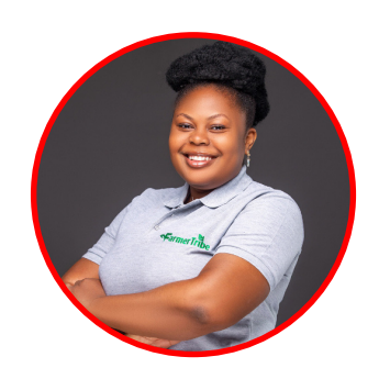
Sepenica Darco 2018 TEF ALUMNI & FERME AGRO-ECOLOGIQUE DOMOU AFRIC (FAEDA) Senegal